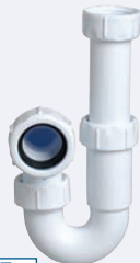
ADJUSTABLE 'P' TRAP